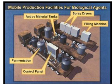
Click for full sized image

The chief proponent of this hoax was Colin Powell, who presented illustrations such as this one to the United Nations on February 5th, 2003 .