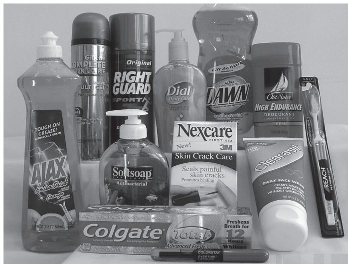
Common household products containing triclosan. See complete list on p. 4.

Triclosan has been used for over 30 years. Its uses were originally confined mostly to health care settings, first introduced in the health care industry in a surgical scrub in 1972. Over the last decade, there has been a rapid increase in the use of triclosan-containing products. 5 A marketplace study in 2000 by Eli Perencevich, M.D. and colleagues found that over 75% of liquid soaps and nearly 30% of bar soaps (45% of all the soaps on the market) contained some type of antibacterial agent. Triclosan was the most common agent found – nearly half of all commercial soaps contained triclosan. 6 While EPA does not publish total sales volume numbers, it is clear that the prevalence of triclosan in multitudes of personal care products amounts to massive quantities of active